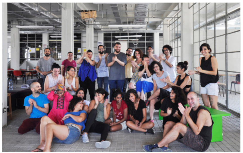
Home Workspace Program 2016-17 | preface, .

As with every year, Open Studios marked the end of HWP, taking place 12-15 July 2017, each fellow presented a new work-in-progress in Ashkal Alwan. The event was highly visited with over 600 visitors throughout the four days.