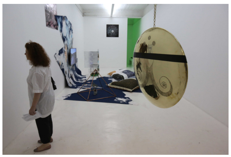
Sharjah Biennial 13 | An unpredictable expression of human potential opening at Beirut Art Center.