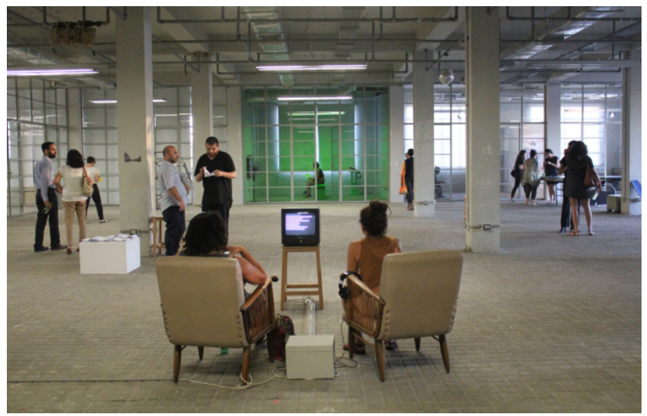
HWP 2016-17 | Open Studios.

In addition, Ashkal Alwan continued to develop its public facilities and the digital archive as well as running its core programs: in June, Home Workspace Program (HWP) concluded the 6th edition with the annual Open Studios, and October welcomed fifteen new fellows for the 7th edition of HWP. Video Works allocated four grants this year, and four additional projects were selected to receive support for the 2017 edition, which took place June 2017.