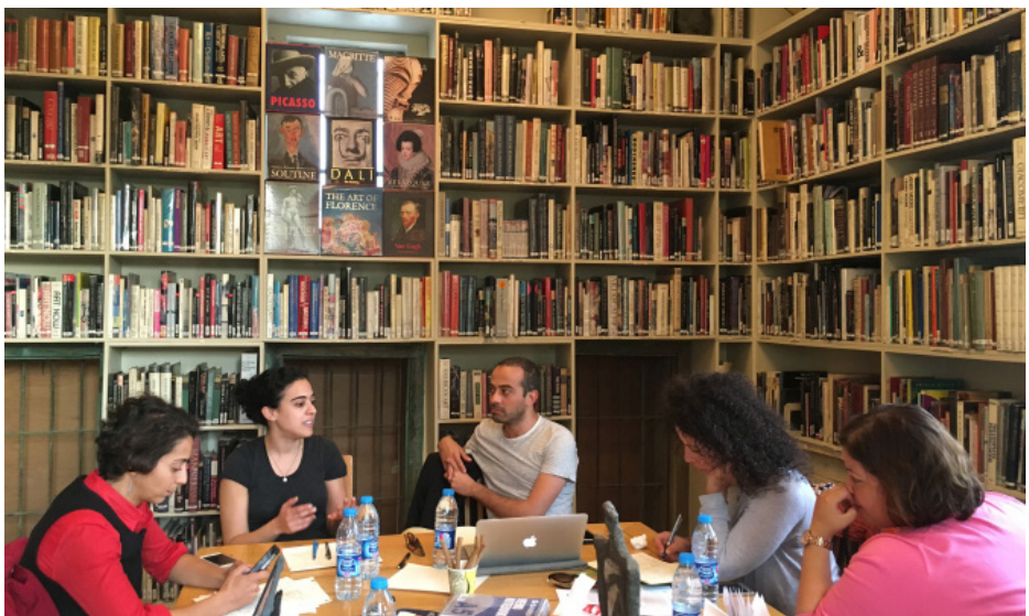
Arts Collaboratory | Middle East 'banga' Meeting in Jordan.

During the assembly, Middle East based organizations: Ashkal Alwan, Al-Ma'mal Foundation (Jerusalem), RIWAQ (Ramallah) and Darb 1718 (Cairo) decided to organise a "banga" meeting in Amman, Jordan to discuss a possible regional collaboration.