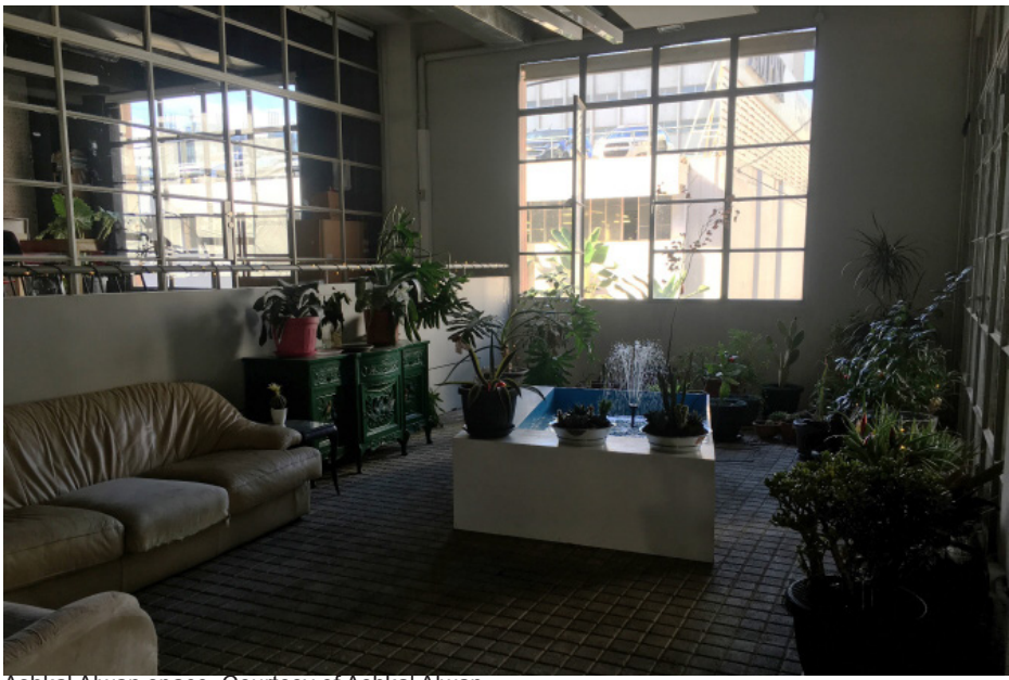
Ashkal Alwan space.