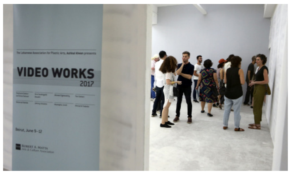
Video Works 2017.