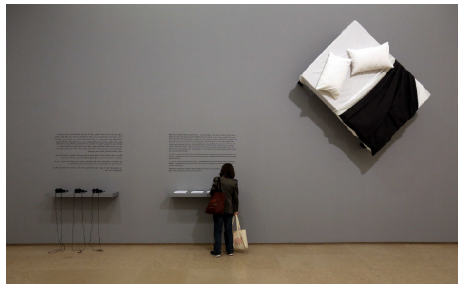
Sharjah Biennial 13 | Fruit of Sleep opening at Sursock Museum.

Hicham Khalidi's exhibition An unpredictable expression of human potential sought to address the current moment of disenfranchisement and frustration, pondering whether the young generation holds the vitality needed to upturn the socio-political legacies of modernity.