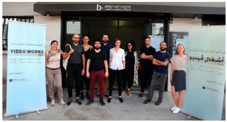
Video Works 2017.